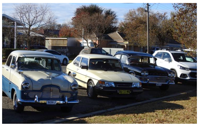
Entrants' cars at the clubrooms