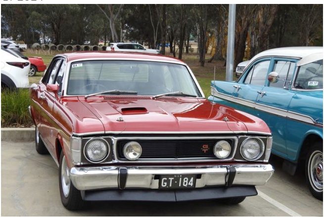
Vehicles on display at The Range Function Centre