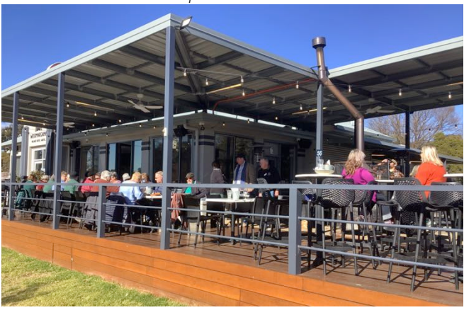
Members mingling on the Pub Verandah