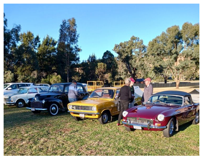
Parked on the grass at Oura Hall enjoying a walk around and beautiful afternoon tea

On the drive home we stopped in at the Oura Hall for afternoon tea, and a sit around in the late afternoon winter sunshine.