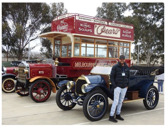
Vehicles on display at The Range Function Centre

Sunday started with the soup stop before heading out on a short drive to the Range Function Centre for our display of vehicles – the weather was not so good.