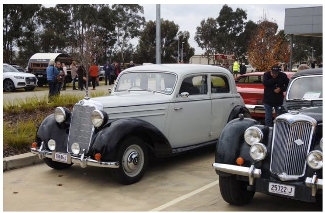
Vehicles on display at The Range Function Centre