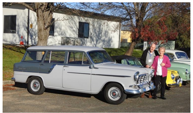
Entrants' cars at the clubrooms