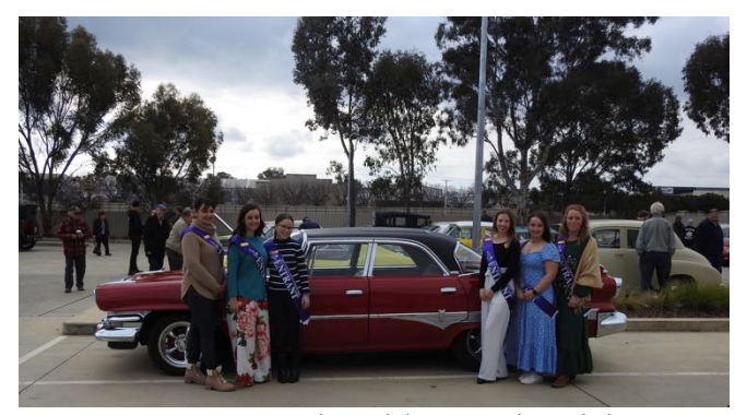
Miss Wagga Entrants braved the wintry day to help out