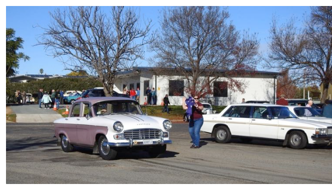
Kelly waving the cars off on the Saturday morning