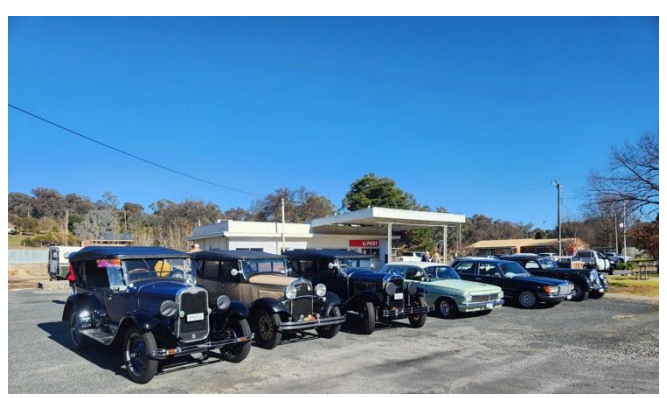
WAGGA WAGGA VETERAN AND VINTAGE MOTOR CLUB INC – THE FAMILY CLUB Page 9