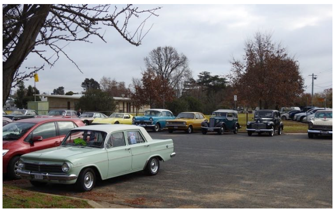
Entrants' cars at the clubrooms and down the street