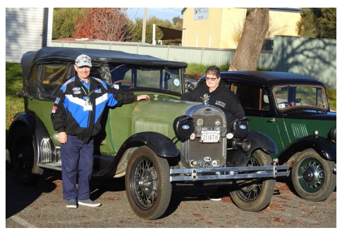
Entrants' cars at the clubrooms