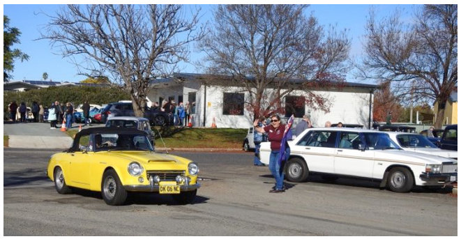
Kelly waving the cars off on the Saturday morning