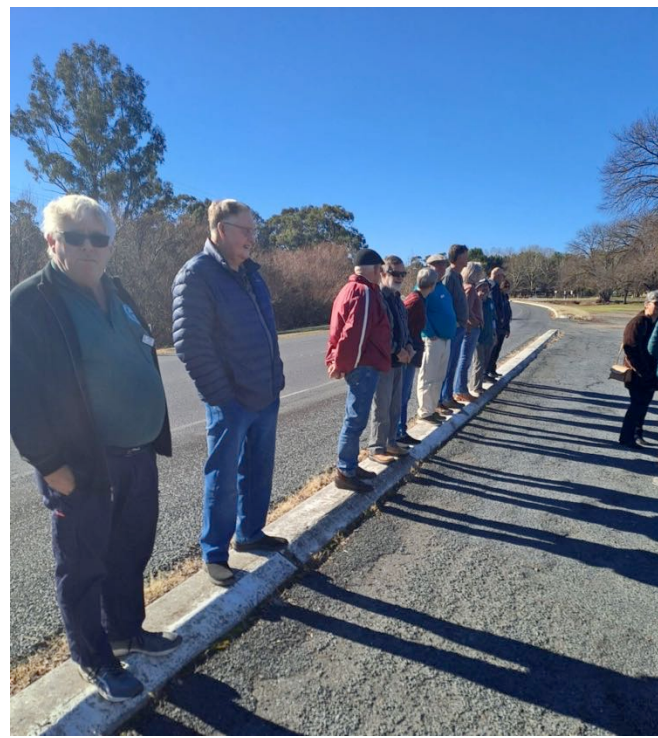
Where else would you stand for a chat in the sun other than the side of a busy road?!